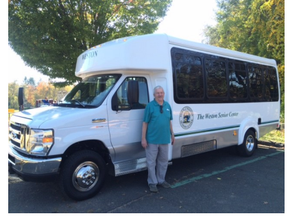
Our New Bus Is Here!